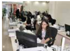
• Customer Care Service that our competitors and business associates speak about.