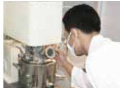
• Innovation of product