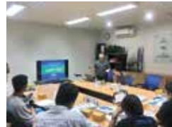
• Product training for customers