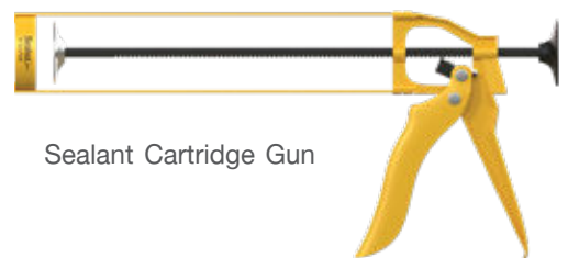
Sealant Cartridge Gun