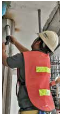
• On site Technical Service